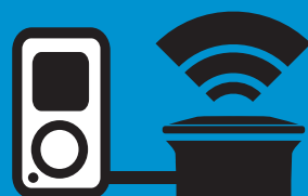
Orbit-M For your MP3 player